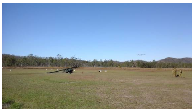
The Shadow Air Vehicle on its way to another mission....