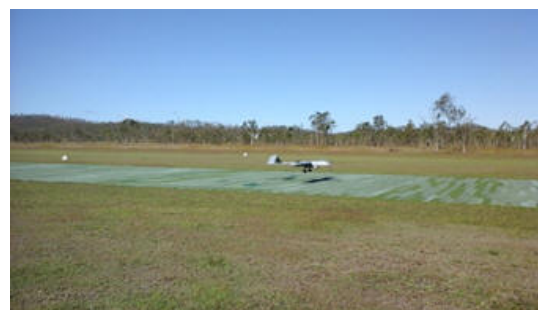
...and coming home.