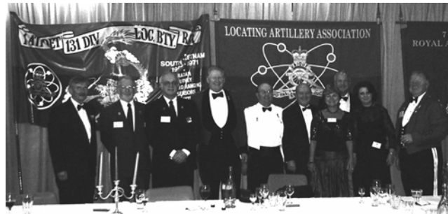
Locators at the 2006 Gunner Dinner