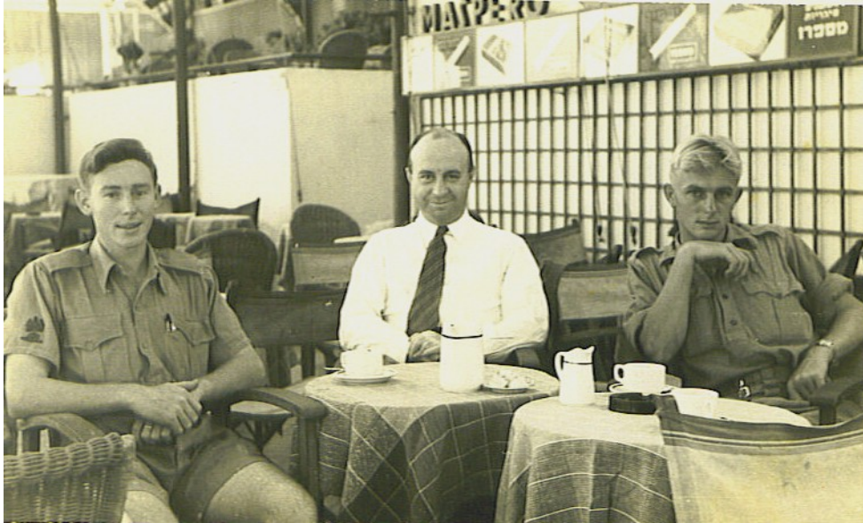
Coffee in a Tel Aviv café (1941)