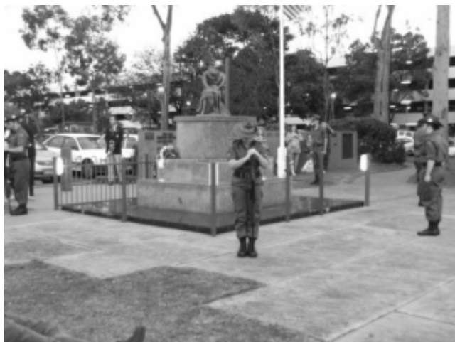
The Cenotaph ceremony was a feature of the Coffs weekend and the Catafalque Party was provided by members of the local Cadet Unit.

Dave Auld reports that the latest Coffs re-union went off very well. There were 210 guests at the official dinner.