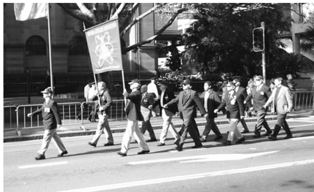
12 Locators on Parade - Sydney Reserve Forces Day Parade 2006