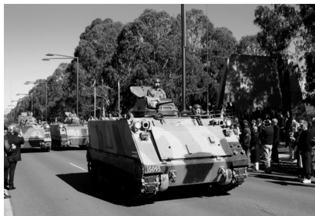
M113's bring up the rear of the march past at the conclusion of the Long Tan Memorial Service, ANZAC Parade Canberra 18 August 2006

The ceremony concluded with a march past of a tri-service guard followed by three M113 APC's.