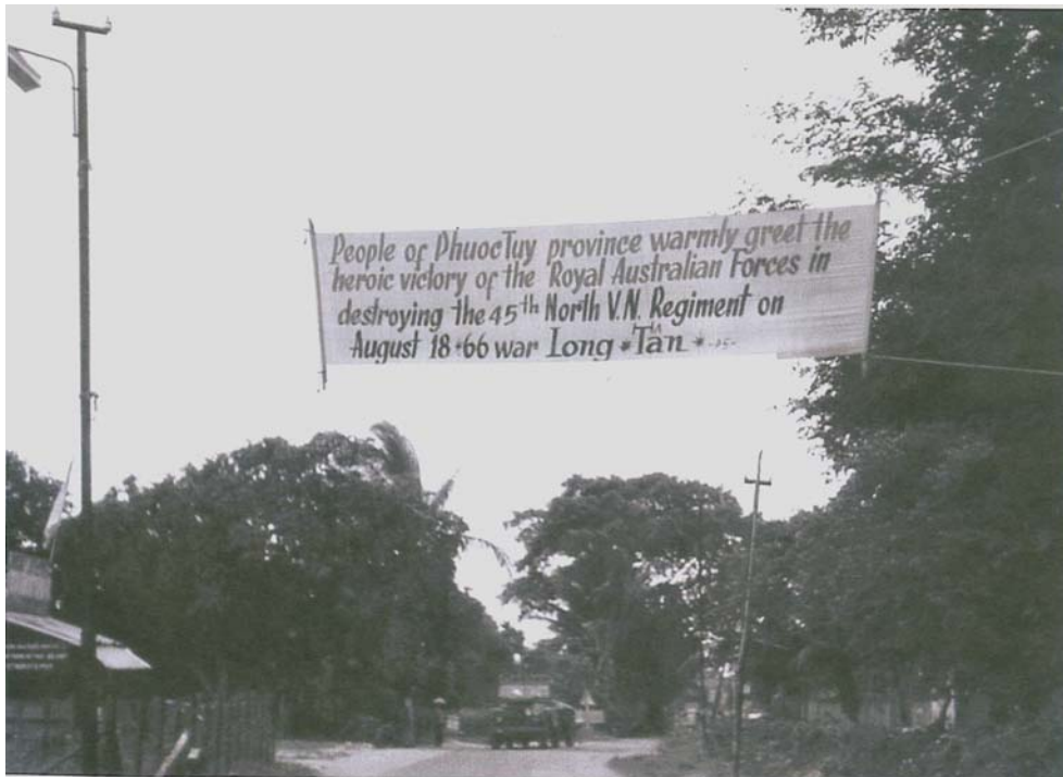
Banner erected by Vietnamese villagers thanking Australian Forces after the Battle of Long Tan 18 August 1966